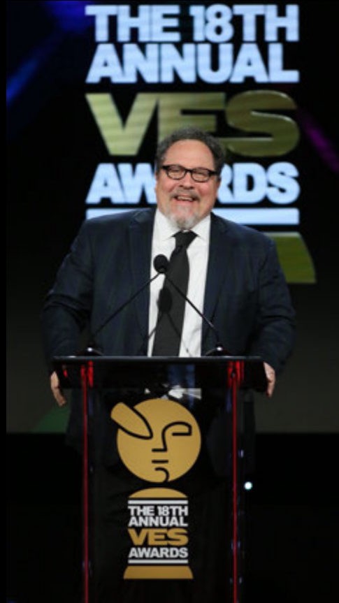
18 th Annual VES Awards Gala (Watch the Video in 3 parts - Members Only.)

BOMBSHELL – Screening (Sydney) THE KING – Screening (Sydney) DARK WATERS – Screening (Sydney) JUMANJI: THE NEXT LEVEL – Screening (Melbourne) 18 th Annual VES Awards Nomination Event (L.A./Bay Area/ Washington/Vancouver/Toronto/Montreal/New York/Georgia/ London/France/Germany/India/Australia/New Zealand) VES Bake-Off Bash After-Party – Party (L.A.) THE TWO POPES – Screening (Sydney) HONEY BOY – Screening (Sydney) MARRIAGE STORY – Screening (Sydney) THE REPORT – Screening (Sydney) THE LIGHTHOUSE – Screening (Sydney) DOWNTON ABBEY – Screening (Sydney) THE CAVE – Screening (Sydney) January Hangout – Event (Atlanta) 25 th Anniversary TALES FROM THE CRYPT: DEMON NIGHT – Screening w/ Q&A (L.A.) STAR WARS: THE RISE OF SKYWALKER – 3D Screening (New Zealand) SIGGRAPH Computer Animation Festival Travelling Show – Screening (Bay Area) New Years Get Together – Pub Night (Berlin) 1917 – Screenings (Bay Area/Atlanta/Adelaide/Paris/Montreal) RED Post Workflow Workshop – Event (London) 18th Annual VES Awards Dinner – Black tie gala at the Beverly Hilton Hotel ( Watch the Video in 3 parts - Members Only. ) (L.A.)