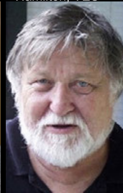
Honorary Member Ron Cobb