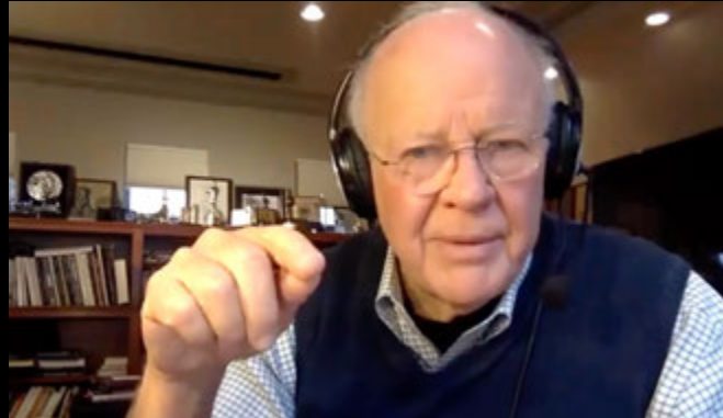
VFX Pros: Home Edition with Visual Effects Pioneer Douglas Trumbull, VES ( Watch the Video. )