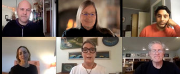
Inside the Animation & Visual Effects of Pixar Animation Studios' ONWARD ( Watch the Video. )

WONDER WOMAN 1984 – Screening (Melbourne)