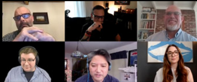
Inside the Visual Effects of Apple TV+'s GREYHOUND – Event ( Watch the Video. )